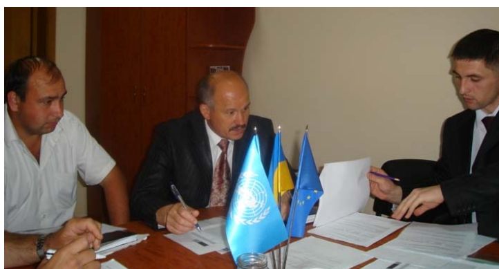
Photo - 9. Selection of village Councils in Ternopilka oblast

During the last quarter of reporting period, 1420 applications were received from village/city councils of 14 regions namely Chernihivska, Ivano-Frankivska, Khersonska, Kyivska, Luhanska, Lvivska, Odeska, Poltavaska, Rivnenska, Sumska, Ternopilka, Vinnytska, Zhytomyrska oblasts and ARC.