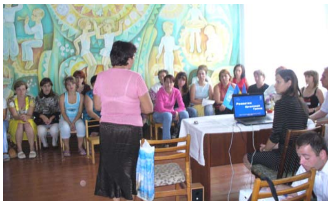
Photo - 11: First dialogue with community, Ivano-Frankivska oblast

Pursuant to the community selection, dialogues were held with the selected communities to sensitize them about importance of collective effort to resolve local development issues in partnership with local authorities and other development agencies including CBA Project.