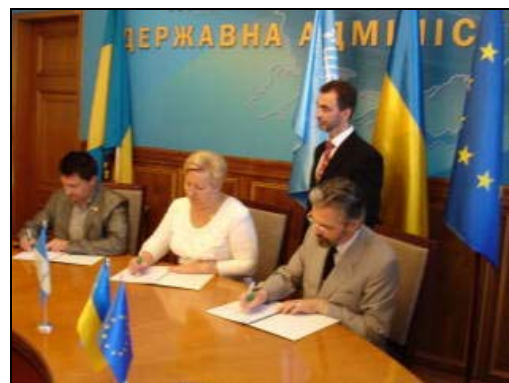
Photo-4: Singing of Partnership Agreement between UNDP and Kyiv oblast authorities

At times, delay in signing partnership agreement at the level of oblast authorities took place due to various factors such as – time taken in reviewing the draft partnership agreement by the internal review system of the oblast authorities, change in leadership, change in priorities of the oblast authorities, change in focal persons, difficulty in making regular persuasion to the oblast officials in case OIU team was not formed.