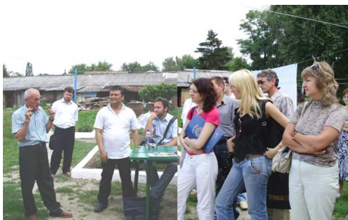
Photo - 14: Exposure visit to Novohrad-Volynskiy, Zhytomyrska oblast

practical experience. The result obtained was twofold: firstly, the training deepened understanding of CBA approach and objectives among the participants; secondly, it created strong teambuilding and mutual cooperation among the CRC-teams which consist of project staffs as well as officials of OSAs deputed to CRC.