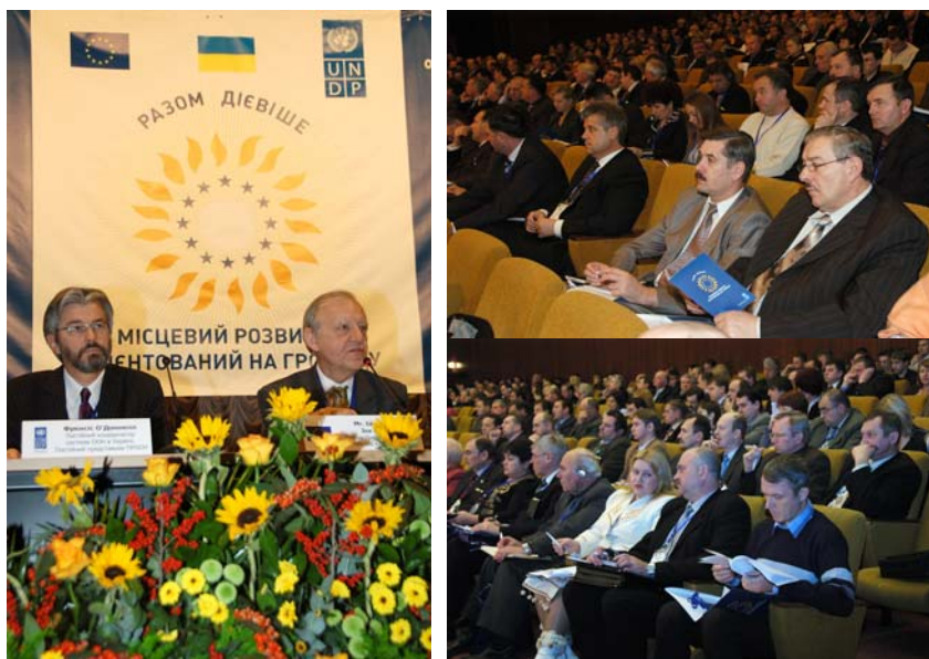
Photo 1. UN Resident Representative Francis O'Donnell and Head of the Delegation of European Commission to Ukraine Mr. Ian Boag with audience of national recognition during CBA Launching

The CBA Project commenced on 4 September 2007 with signing of agreement between the Delegation of the European Commission to Ukraine and UNDP Ukraine. National launching of the Project took place on 4 December 2007 in participation of representatives of Delegation of European Commission to Ukraine, UNDP, Secretariat of the Cabinet of Ministers of Ukraine, representatives of Ministries, central and local governments as well as other parties.