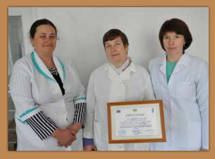
Khoroshiv village, Khmelnytsk region

Spring works in Kairy village go into high gear. The local agricultural cooperative is equipped with a harrow, a seed drill and a tractor procured under the CBA project - all a novice cooperative needs to be efficient and self-reliant.