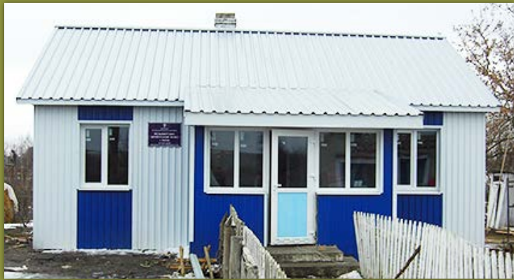
Find 10 differences (and more)! After renovation, health post in Zavyziv village, Rivne region, has changed beyond recognition. The CBA-backed micro-project allowed to repair roof and facade, install energy saving windows, and purchase new equipment. Villagers say the health post looks like brand new!

The CBA News Digest has been produced in the framework of the Community-Based Approach to Local Development (CBA) Project, which is financed by the European Union and co-financed and implemented by UNDP. The contents of the digest are the sole responsibility of CBA staff and cannot be taken to reflect the views of the European Union or UNDP.